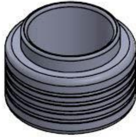
Spring Spacer (4ea) 44U