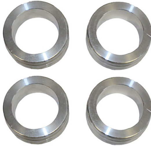
Front and Rear Spring Spacer 32i (4ea)

Note: Left and right positions are from the seated position on the ATV.